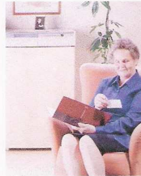
FIGURE 30 FOOD AUTOMATE