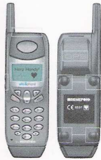
FIGURE 31 MEASURING EKG WITH A MOBILE